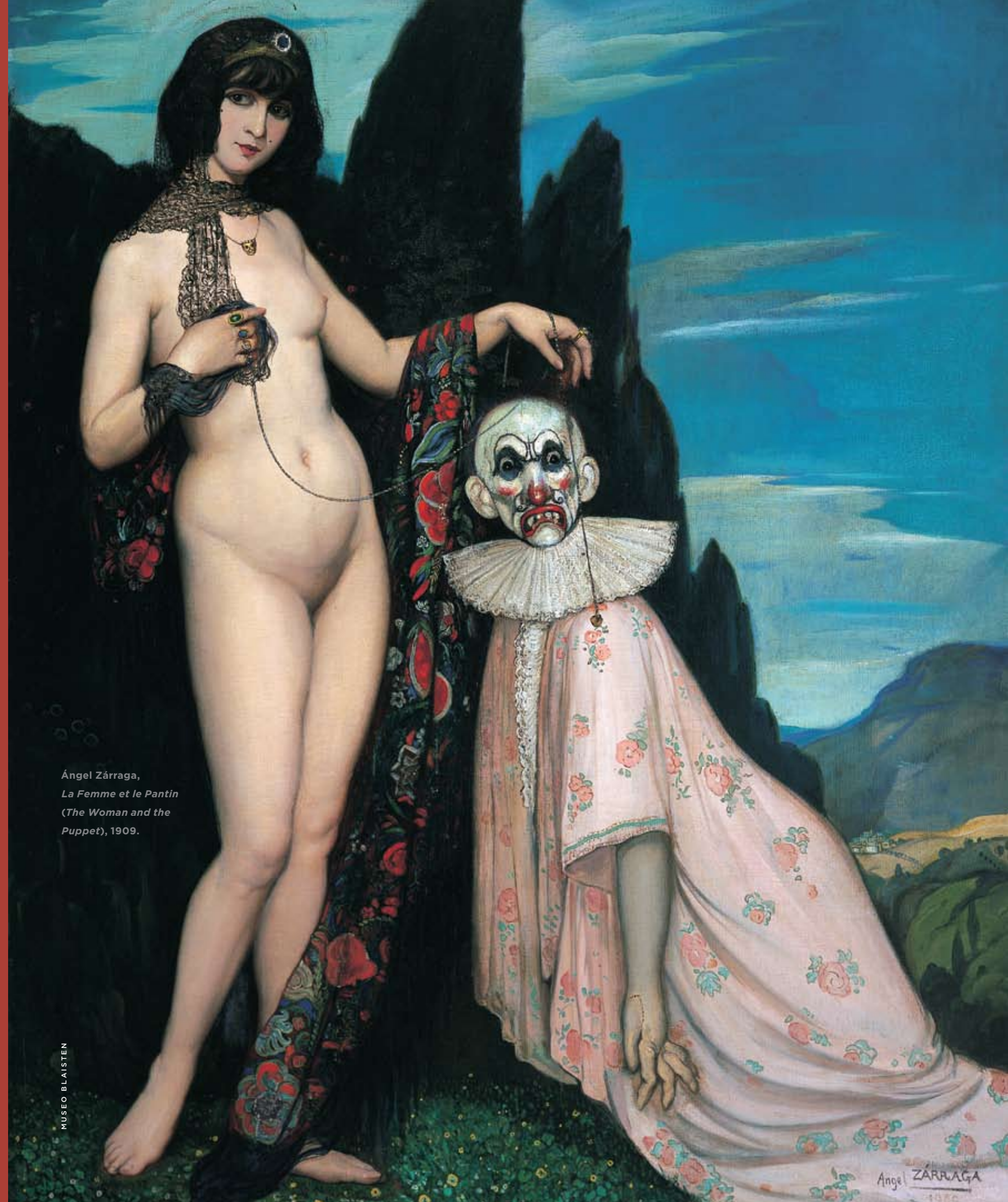
Ángel Zárraga, La Femme et le Pantin ( The Woman and the Puppet ), 1909.