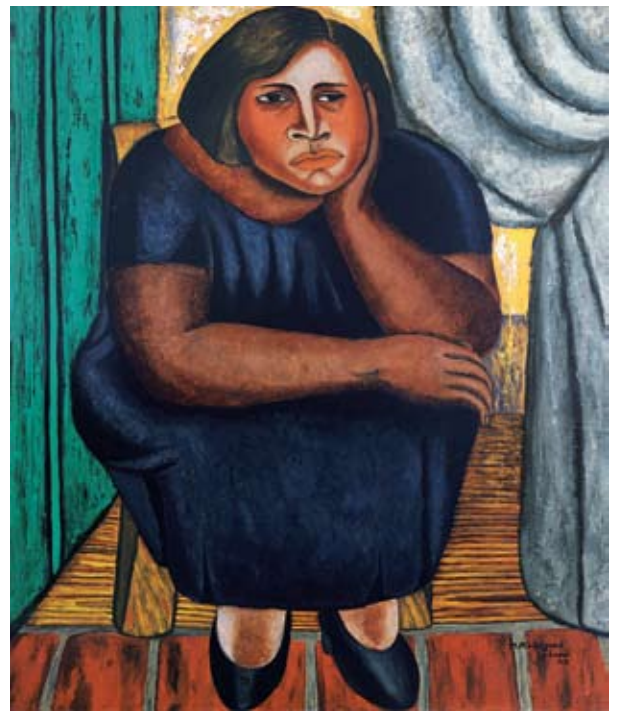
From left: María Izquierdo, El Idilio (The Idyll), 1946; Manuel Rodríguez Lozano, La Ramera (The Whore), 1927; José Clemente Orozco, Prometheus , 1930, fresco mural.

Of course, Mexican artists also produced works influenced by Symbolism, Surrealism and other styles and movements. Artists like Frida Kahlo, Rivera’s wife, developed deeply personal modes of image making. Still, the heroic murals cast a long shadow—even over the muralists’ other works. Today, oil paintings, watercolors and drawings by Rivera, Siqueiros and Orozco have become pricey and rare. Like Kahlo’s paintings, which have enjoyed a boom in the market and earned a feminist-mystical place in the pop-culture arena,