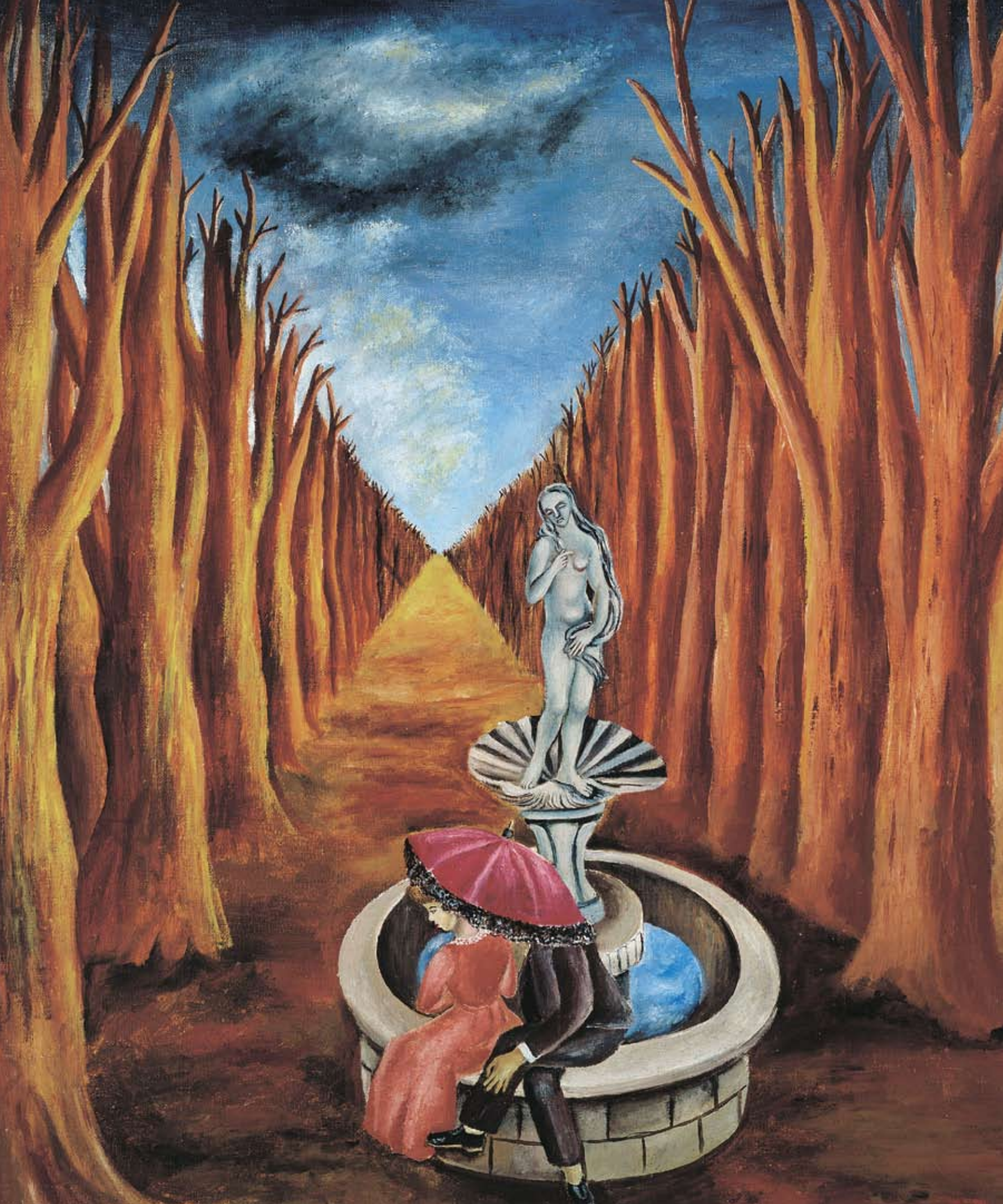
MUSEO BLAISTEN; POMONA COLLEGE MUSEUM OF ART

Despite the standard art-history-book summary of Mexican modernism, there actually is much more to this colorful subject than the works, emblematic though they might be, of Los Tres Grandes (The Three Great Ones)—Diego Rivera, David Alfaro Siqueiros and José Clemente Orozco. Their epoch-defining murals painted in the decades following the 1910–20 revolution that ousted the dictatorship of Porfirio Díaz gave enduring expression to a proud people’s still-emerging sense of national identity. In the 1920s they began painting the large-scale murals in schools and government buildings that would become indelibly associated with their names and with uniquely Mexican interpretations of such seminal European modernist movements as Post-Impressionism and Cubism.